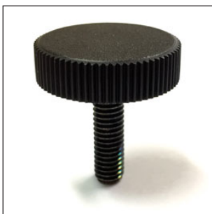
Espiga de acero tratado, roscada. POM: Resina acetálica.